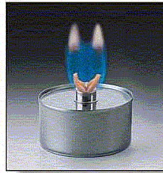
Diethylene glycol with a liquid fuel container