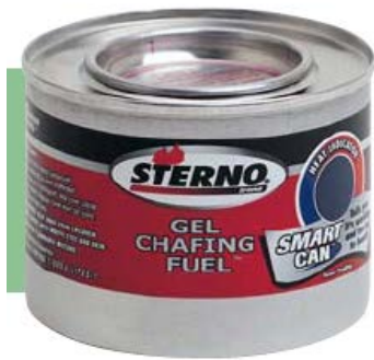
Gel Chafing fuel with container